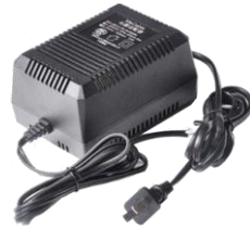
TEAC-66-243000V (EU) MKAC-66-243000U (USA) TEAC-66-243000VB (UK) Power adapter