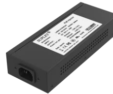
LAS60-57CN-RJ45 Hi-PoE Midspan