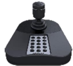
DS-1005KI USB Joy-stick