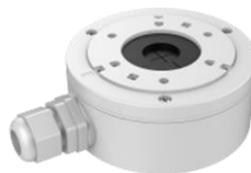
DS-1258ZJ Wall Mount