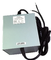
MKAC-96-248000V (UK) MKAC-96-248000V (EU) MKAC-96-248000U (US) Power Adapter