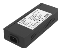
LAS60-57CN-RJ45 Hi-PoE midspan