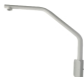
DS-1660ZJ Parapet Mount