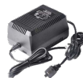
TEAC-66-243000V (EU) MKAC-66-243000U (USA) TEAC-66-243000VB (UK) Power adapter