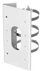
DS-1475ZJ-SUS Vertical Pole Mount